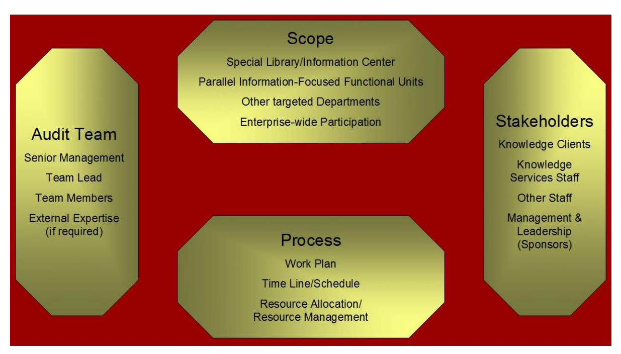
Fig. 3 Terms of Reference Model for the Information Audit